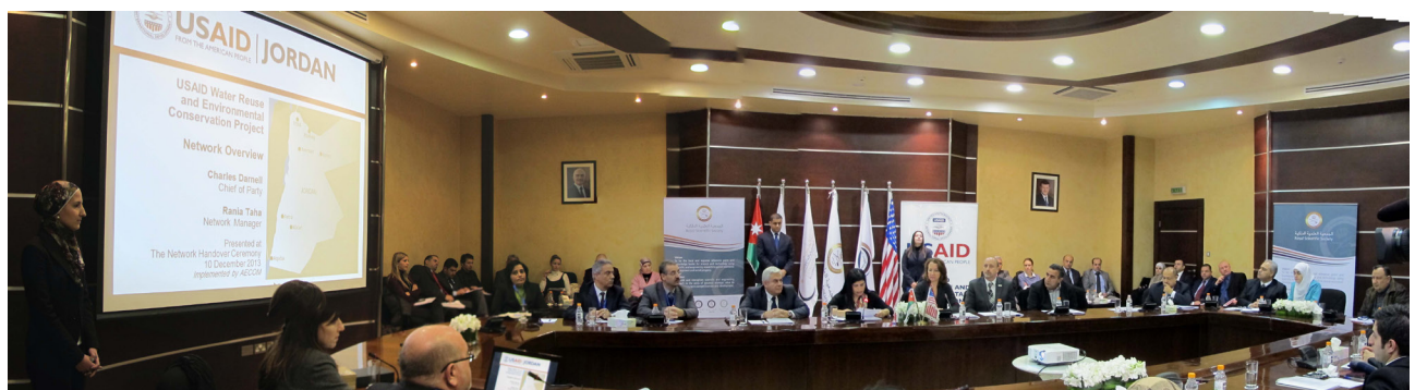
Above: Project handover ceremony

The high turnover of leadership and staff within the MoEnv had a negative impact on organisational knowledge and project follow through. This required the project team to re-introduce the project several times within a five-year period. The progress made in spite of this challenge is a reflection of the strength of the relationship of the project team with the ministry. The high turnover poses a challenge with regards to the sustainability of this progress beyond the programme timeline.