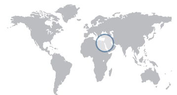
The Hashemite Kingdom of Jordan